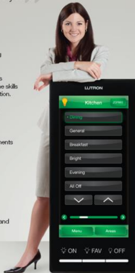
▲ Dynamic keypad in Black