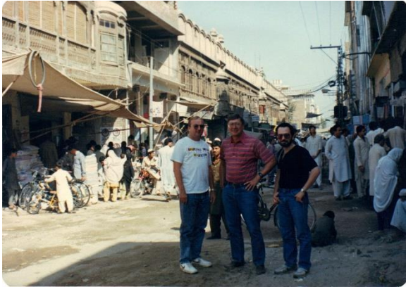
Peshawar street scene

One of the things one learns when traveling is the necessity to negotiate every transaction. Not to do so is considered insulting, and a sign of weakness. Besides, you could ruin the vendors day, depriving him of the pleasure of trying to cheat you!