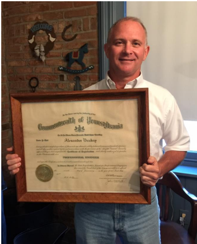
Something to be proud of!