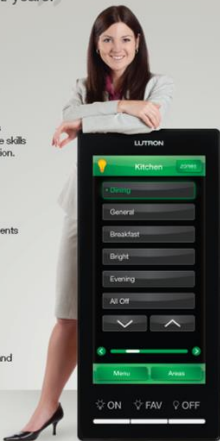
▲ Dynamic keypad in Black