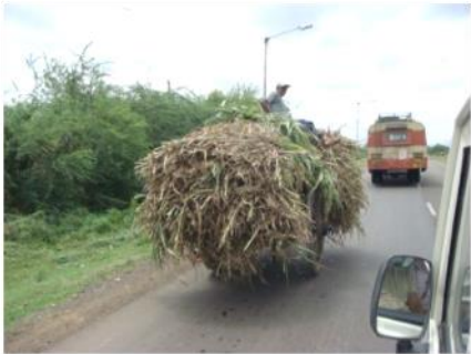
Trust me there is a cart under there.

whatever they have to make it work for whatever they need it to do. The creativity knows no bounds. It was no surprise to find a family of five all on a Honda Hero motor bike, or seeing how much could be loaded on a three wheeled vehicle, or your standard oxcart.