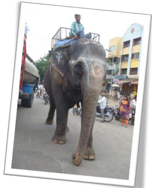
Where does an elephant go? Wherever it wants to.

can quickly see how fast the country is growing, and how everything from infrastructure to the system of regulations cannot seem to keep up with the fast pace of progress. You also realize not to take for granted every bit of quality engineering, planning, and construction involved to get you from A to B safely.