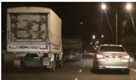
Notice no tail lights and headlights on the truck.

As we left the city I was amazed at the traffic and congestion even at this early hour of the morning. I was informed that such an influx of truck traffic at night is normal since they cannot come in and out of the city during the day.