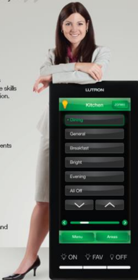
▲ Dynamic keypad in Black