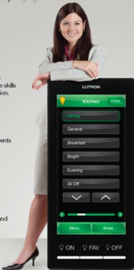
▲ Dynamic keypad in Black

Opportunities are also available in sales leadership and field engineering leadership— hiring all majors.