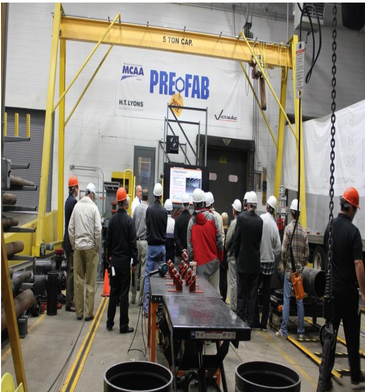
The Tour in the assembly shop

industry. The company is truly global, with 15 major manufacturing facilities, 28 branches worldwide, and over 3,600 employees, 1,100 in the Easton area. Victaulic products are installed in 120 countries across diverse business lines including oil, gas and chemical, mining, power generation, water and wastewater treatment, military and marine systems, commercial buildings and fire protection.