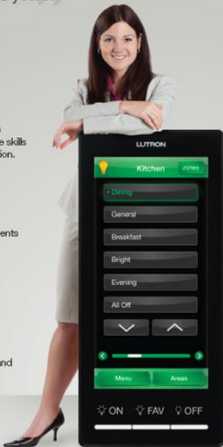
▲ Dynamic keypad in Black