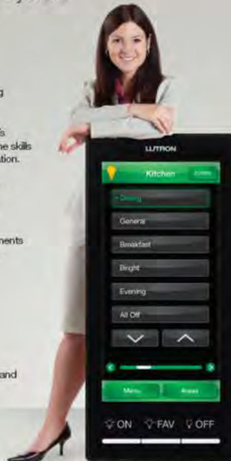
▲ Dynamic keypad in Black