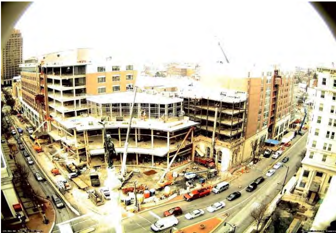
Current Job Cam 12/31/2013

The Downtown Redevelopment Project consists of a multi-function hockey arena, a seven-story mixed office building and shops with direct access to the arena, and a nine-story 180 room hotel. The arena seats 8,500 hockey fans and will be ready for the 2014 hockey season. Wooden pads on top of the ice will increase the general seating to 10,000 for other events.