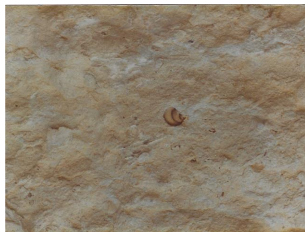
A snail shell lying on the ground.