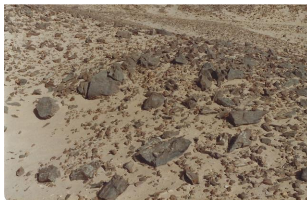
Pieces of petrified wood lying on the ground

Fossils could often be found just lying on the ground. This section of the Sahara was covered mostly with rocks, with the sand blown into depressions. It had once been a military reservation where the Egyptian army practiced their craft. Exploding ordnance put small holes in the ground exposing all kinds of stuff, from snails to petrified wood.