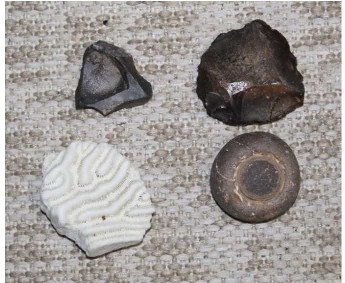
Upper left and right: Petrified wood. Lower left: looks like imprint of seaweed. Lower right: No idea. Looks like a round stone ball inside a round hole in stone.

I brought a bunch home, then proceeded to give them to my grandchildren to take to science class in school. They were always a hit! Actual fossils!