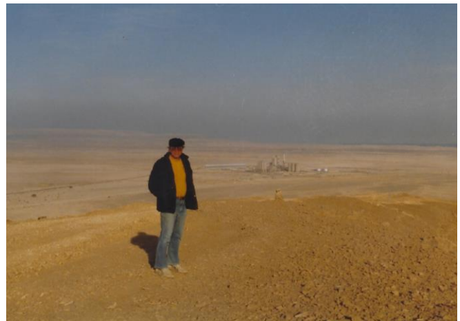
The loneliness of the desert. The cement plant is in the background. Yes, it gets cold in the winter.

The first year we lived in a guest house Helio- polis, (Masra Gedida, New Egypt in Arabic) a suburb of Cairo. The site was in the Eastern Desert 60 km south of Suez. We rode the ninety miles to the site daily. Thereafter we lived on site, under so-so conditions in housing we lovingly referred to as "Siberia".