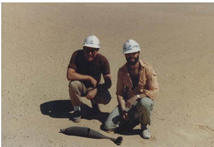
No, not a critter from then Red Sea, but a shell fired by a tank.

But it was more fun to search for them in the wadis in the area. Wadis are dry streambeds, anywhere from a few feet to a dozen feet high and a few yards to up to a hundred yards across. It doesn't rain much in the desert but when it does the wadis fill with torrents of water, eroding the banks, exposing all sort of things. According to various sources more people drown in a desert than die of thirst. I can believe that. I've seen a half inch of rain cause flash floods, wiping out roads and anything else in the way.