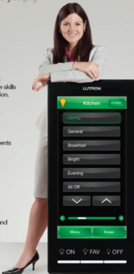
▲ Dynamic keypad in Black