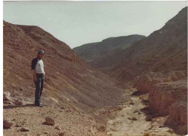
Overlooking a wadi.

The most amazing thing! Drive into the desert for a few miles with no vegetation except a few scrubby bushes, yet we were surrounded by flies. Where did they come from? What did they eat when there were no people around? They couldn't have come with us, we were driving too fast, yet here they were! The only conclusion we came up with is that the rocks were edible to flies.