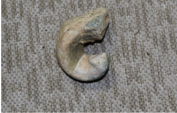
Not sure what this is. Probably a snail, but we conjectured that it was petrified whale poop.