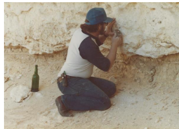
Digging for fossils. Note bottle of "desert survival fluid."