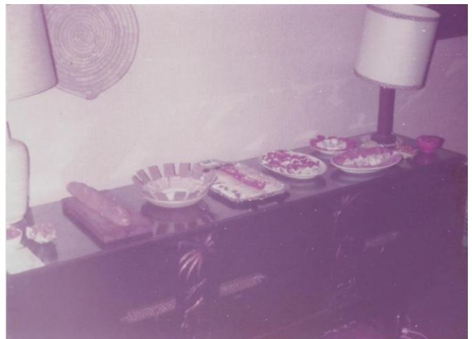
The hors d'oeuvre table

The Thanksgiving meal in Indonesia was organized and prepared by the wives of our colleagues who had accompanied their husbands. I don't know how they managed to find all the goodies, but they did. The meal was fabulous! This was a