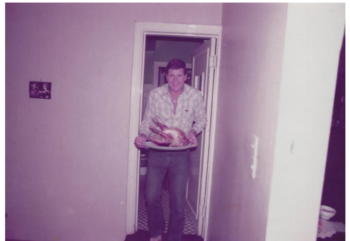
The pièce de resistance