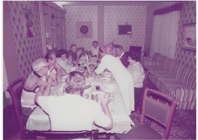
Thanksgiving dinner, Egyptian style

Our company, Fuller Co., had a policy of paying for Thanksgiving dinner at all overseas locations. And, we were encouraged to invite whomever we choose. So besides our colleagues we invited our drivers, their wives, and the cook's wife, who assisted in the preparation and serving. The meal, and the day, was a success, by any measure.