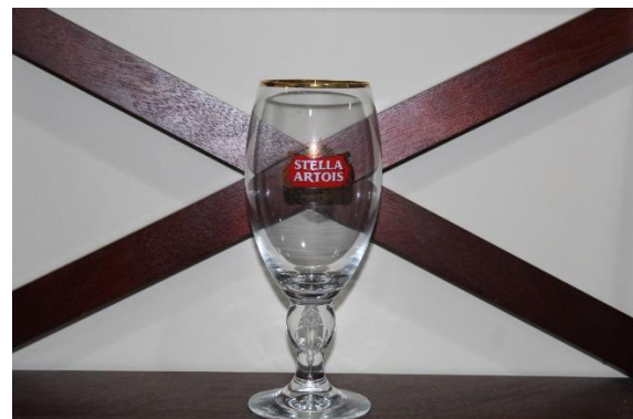
My prized possession!

Since then, I've had a penchant for Belgian beer. When Stella Artois became widely available in the Lehigh Valley I partook with vigor and enthusiasm. I also like Kölsch from Germany, but Stella is still my first choice. It is also available in bottles, but I've lost my taste for bottled beer. I believe that God intended for beer to be from a tap, or from aluminum cans. It was why He allowed aluminum to be invented.