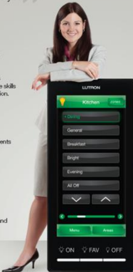
▲ Dynamic keypad in Black