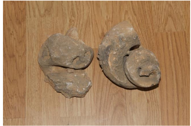
Petrified whale poop?

What one finds around the house when putting away Christmas decorations! After writing last year's article on fossiling in the desert of Egypt I found more fossils around the house.