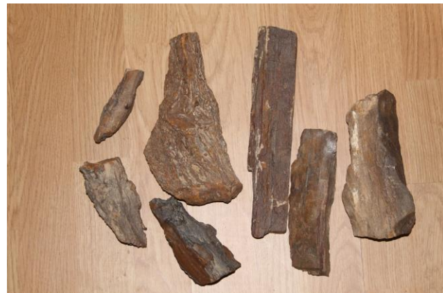
More petrified wood