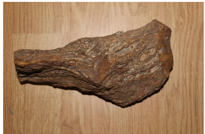
Close-up of petrified wood