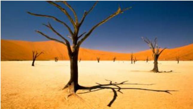
A stark scene in the Namib Desert.

The country of Namibia, located North West of South Africa, bills itself as "The Road Less Traveled". And it is. The driest deserts in the world are in Namibia. Situated between the Namib and the Kalahari deserts, Namibia has the least rainfall of any country in sub-Saharan Africa. Namibia is the home of Bushmen, who left a rich artistic legacy reminiscent of the petroglyphs found in Southwestern US.