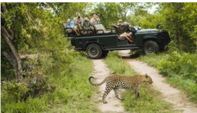
Leopard in Kruger National Park – in an open vehicle?