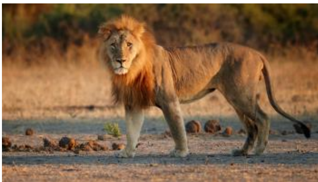
El gato grande