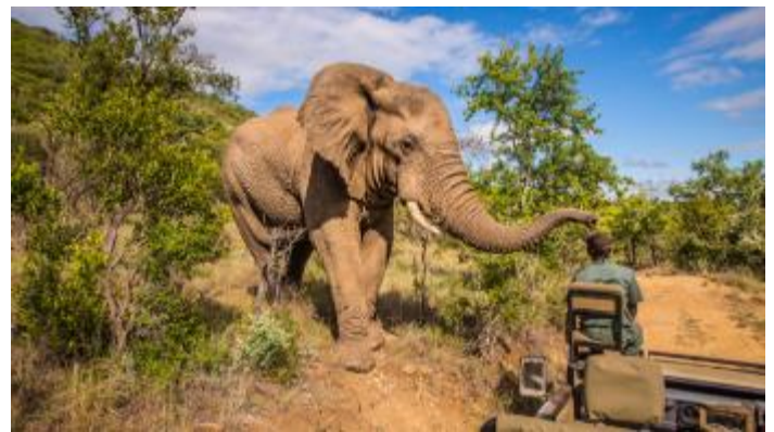
A panhandler looking for freebies?