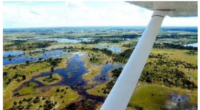
The Okavango Delta. A patchwork of water, low-lying islands, and grass.

The Okavango Delta is seemingly an anomaly, in that it is a river delta in the midst of a desert! There is no outlet to a sea. The Okavango is produced by seasonal flooding of the Okavango River. For half the year the area is a dry desert; when the water arrives, it is a rich inland sea, creating one of Africa's greatest concentrations of wild life.