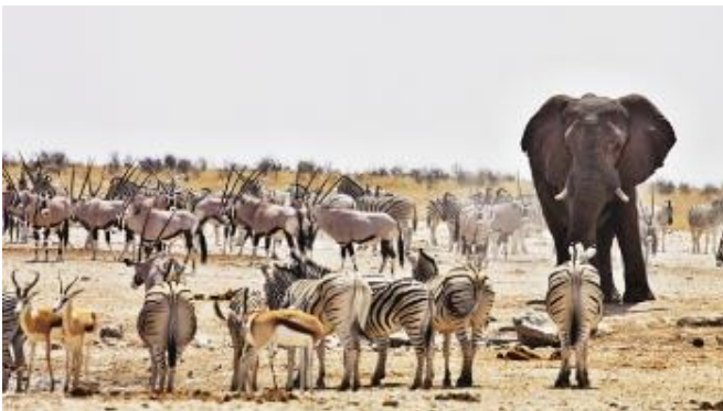
The peaceable watering hole; no bartender needed.