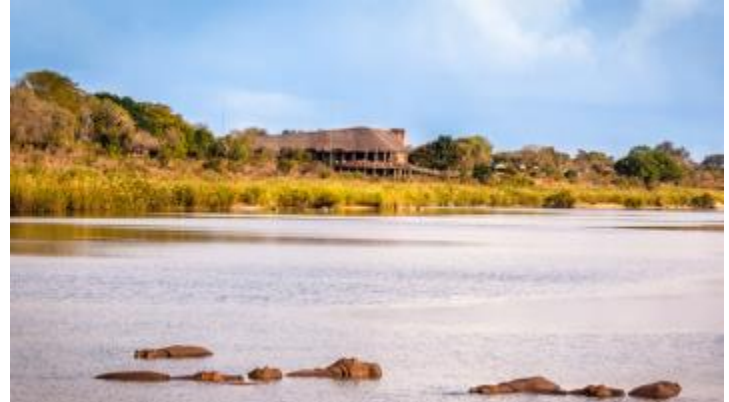
Just a casual swim.

Neil's firm has tours in Namibia, Botswana, South Africa, Lesotho, Swaziland, Zambia, and Zimbabwe, but his emphasis is South Africa and Kruger National Park. The Sabie River, located in the southern sector of the Park, has more lions and leopard than anywhere in the world. Also, lots of elephants and hippos. Tours (as can be seen in the photos and videos) is usually in an open-air vehicle, though an enclosed vehicle is used in potentially dangerous situations.