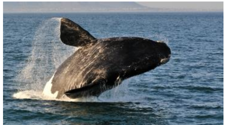
Prime whale watching on the Hermanus coast.

ther popular activity is great white shark watching, from inside a cage.