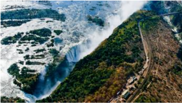
Aerial view of Victoria Falls