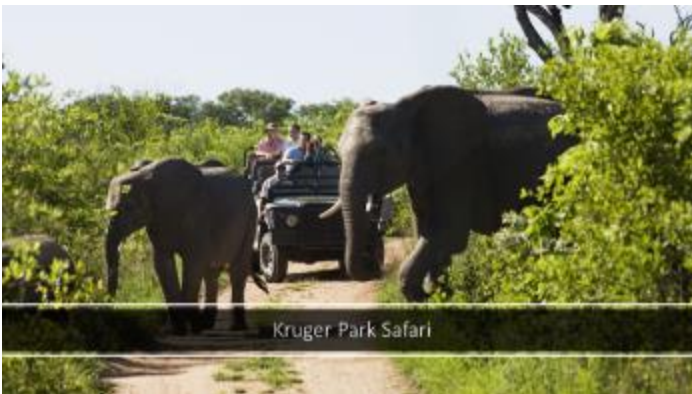
The bigger guy has the right-of-way!