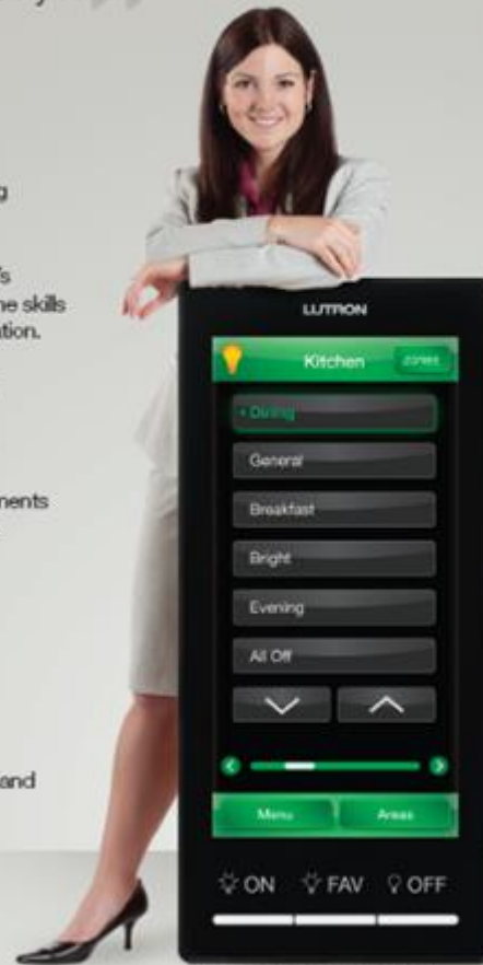
▲ Dynamic keypad in Black