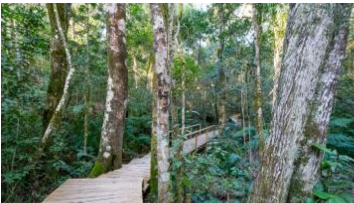
A nature walk in Kruger National Park