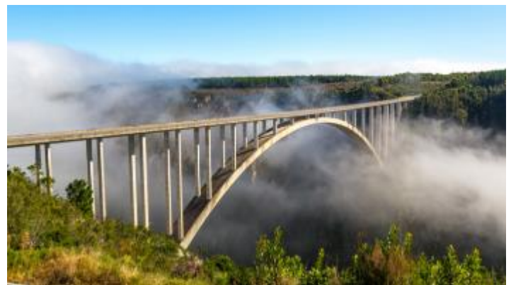
Bridge in the Mist!